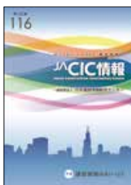
JACIC-INFORMATION (Book 2 times / year)

JACIC publishes publication in the construction information field.