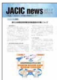
JACIC-news (on Web every month)